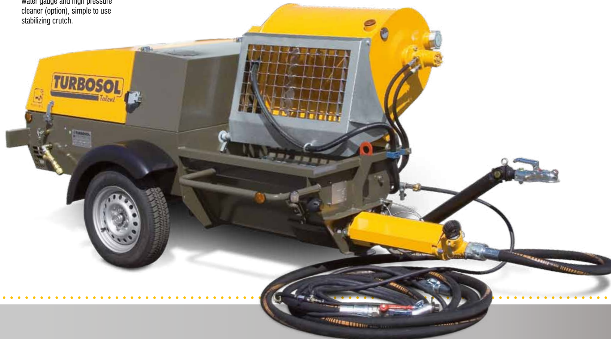
SIZE VERSIONS DM (cm)

It guarantees a wide range of uses. It ensures maximum yield by working large amounts of materials, thanks to the capacity of the mixer machine, of the hopper and the flow rate of the worm-gear pump. Thanks to the special Hydrotronic hydraulic circuit with variable displacement pump, it optimises performance and allows to save up to one litre of fuel every hour.